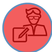
Office Manager Vacant